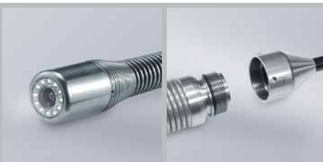
Camera head with 12 high-performance LEDs