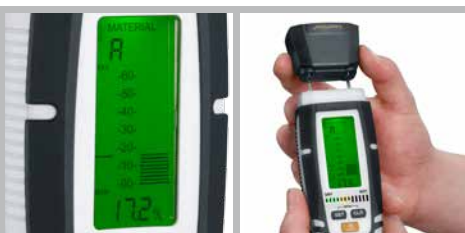
Large, illuminated LC display