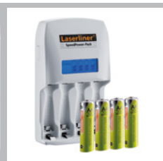
High-quality external Quick-Charger