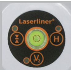
Illuminated vial for pre-adjustment