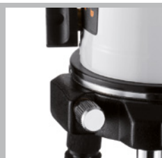
Stable metal base with vernier adjustment