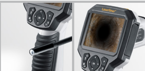
Camera head (ø 9 mm) with LED-Lighting 3,5" TFT colour display