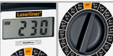
Large LC display