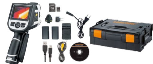
1/4" tripod adapter