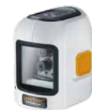
SmartCross-Laser + batteries

Packing dimension (W x H x D) 125 x 320 x 105