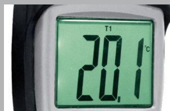
Illuminated, clearly arranged display