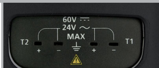
Dual K-type inputs