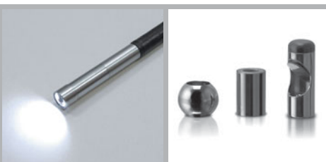
Camera head (ø 4 mm) with LED lighting