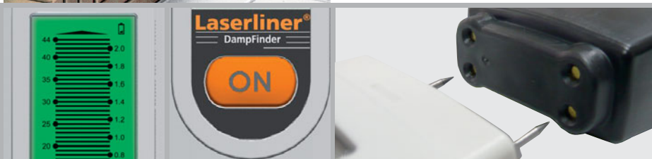
Large, clear LCD